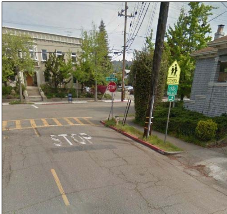
Figure 2. Existing Designated Bicycle Route on Colby Avenue at Alcatraz Avenue

which has been funded and approved and is scheduled for implementation in 2012. 11 There are also Class 2/3A bicycle facilities (designated bicycle route with bicycle lanes) prioritized on Alcatraz Avenue as part of a SR2S grant, which was awarded several years ago and should be completed in 2012, and other Class 2/3A bicycle facilities planned for Claremont Avenue starting on Alcatraz Avenue and extending beyond Highway 24 to Telegraph Avenue. 12 There is also a proposed Class 3B bicycle facility (bicycle boulevard) planned for Colby Avenue in the proposed project area that the Draft EIR assumes will not be implemented, even though signage is expected in 2011 and accompanying pavement marking is expected in 2012. Further, the Draft EIR does not correctly identify the existing Class 3 Colby Avenue bicycle route in Figure 4.3-4 and in the 2007 Oakland Bicycle Master Plan, shown in Figure 2, nor does it consider its potential impacts.